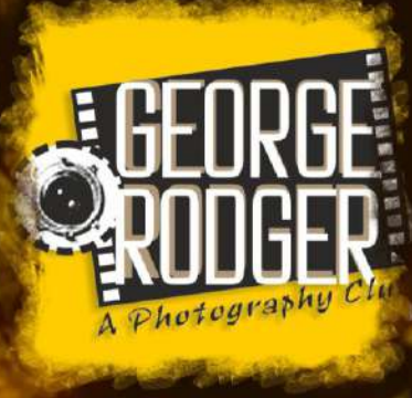
George Rodger The Photography Club