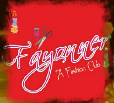
Fayonner The Fashion Club