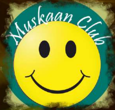
Muskaan Club The Philanthropy Club