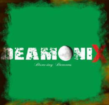
Deamonix The Dance Club