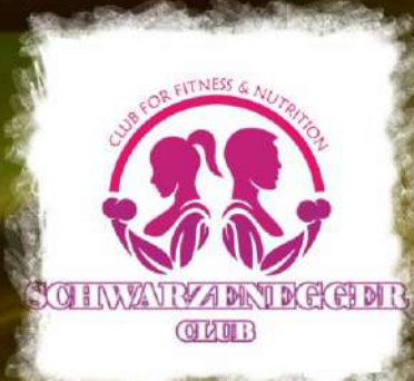
Schwarzenegger Club For Fitness & Nutrition