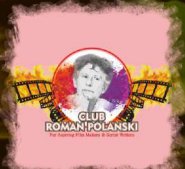
Roman Polanski The Film Making Club