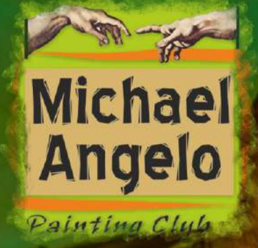
Micheal Angelo The Painting Club