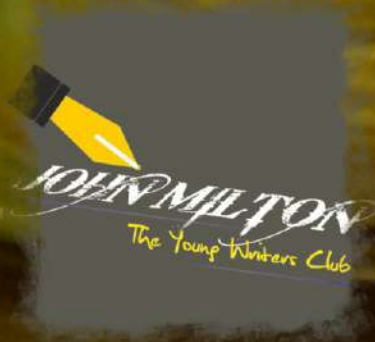
John Milton The Writer's Club