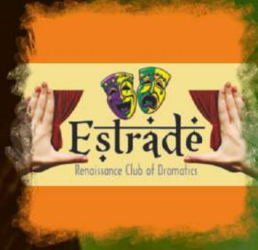
Estrade The Dramatics Club