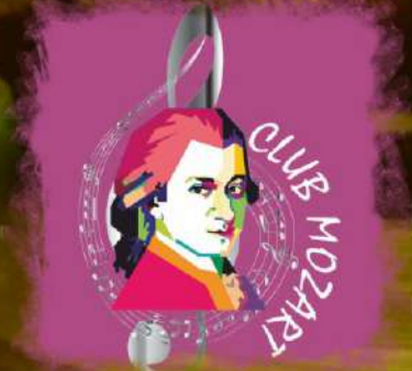
Club Mozart Club For Young Musicians