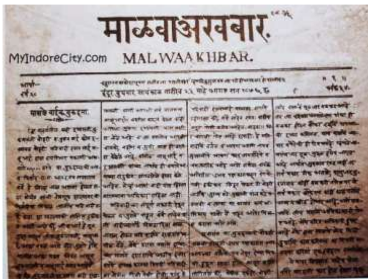
Indore's First Bilingual News Paper, MALWA Akhbar. Dated 23rd August 1876.